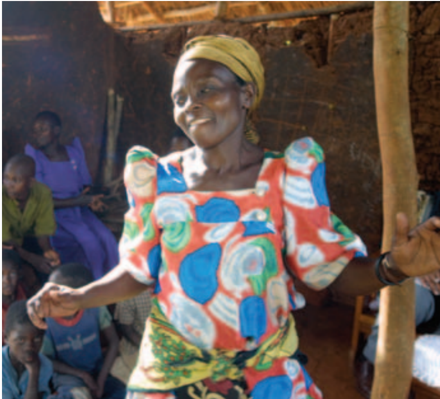
The spirit of celebration: a woman in Uganda expresses her joy in life.