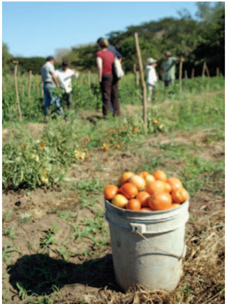
Tomatoes in a field farmed by the Playa Grande community in El Salvador.

Before colonisation every world culture was sovereign with regard to food: that is, they produced what they consumed. Following colonisation the best lands of all