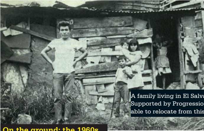
A family living in El Salvador in 1977. Supported by Progressio, this family was able to relocate from this area to safer housing.