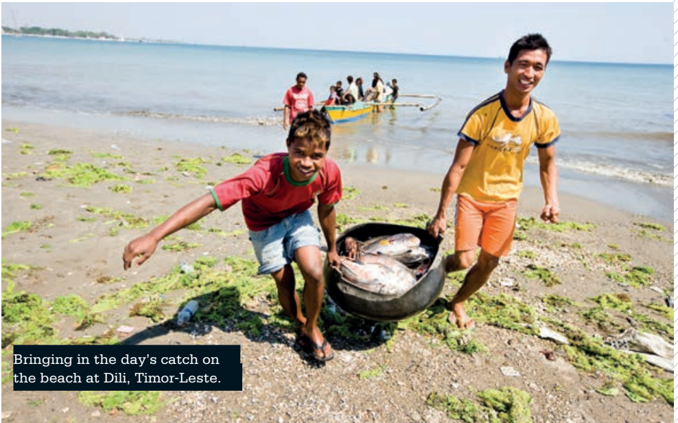
Bringing in the day's catch on the beach at Dili, Timor-Leste.

I'd like to thank Progressio's supporters too. Their solidarity has made an enormous difference and continues to bring much needed hope and support in other fragile nations where Progressio is working.