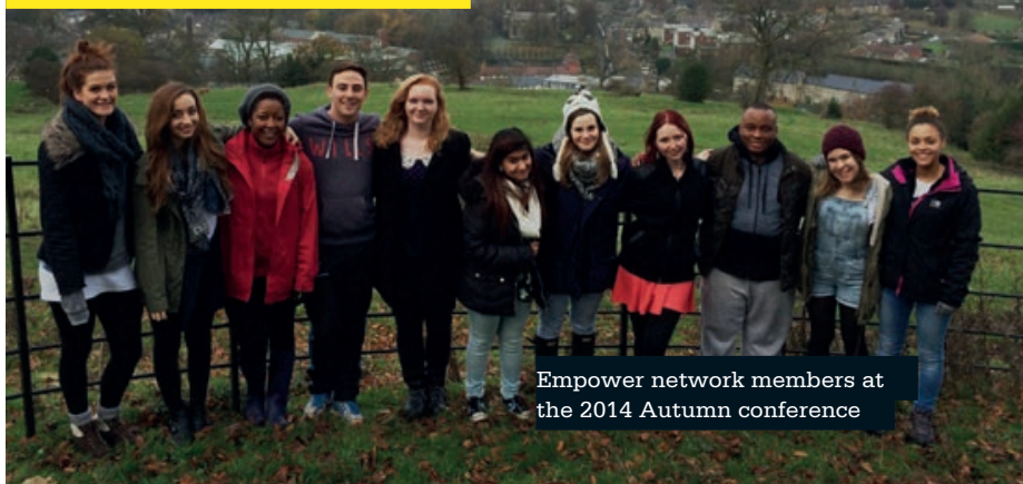
Empower network members at the 2014 Autumn conference