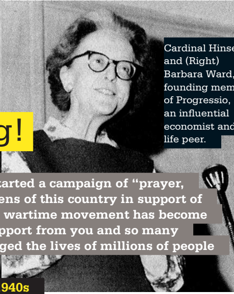
Cardinal Hinsley and (Right) Barbara Ward, founding member of Progressio, an influential economist and life peer.